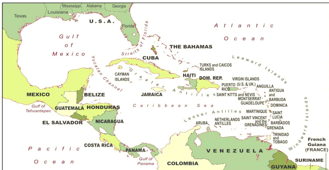
Map of the Caribbean