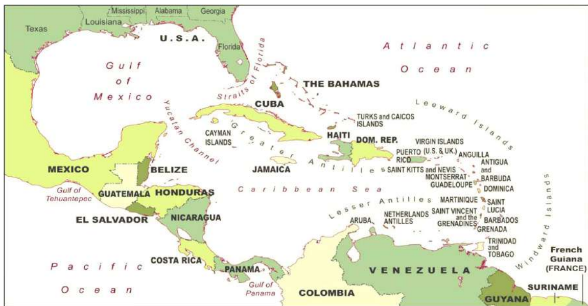
Map of the Caribbean