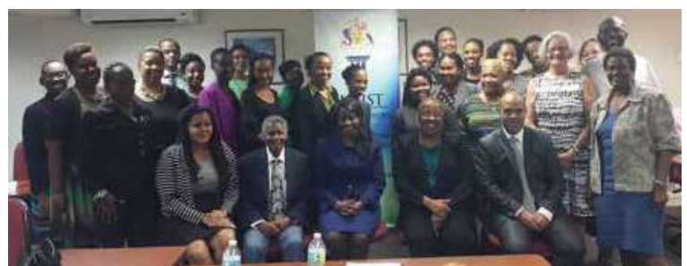
Cohorts I and II of the Practical Mediation Skills Training Workshop