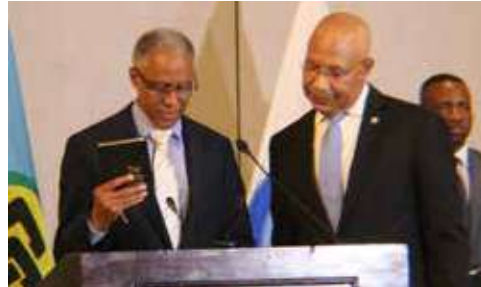
The Honourable Mr. Justice Adrian Saunders (left), newly sworn in President of the CCJ, takes the oath of office administered by His Excellency the Most Honourable Sir Patrick Allen, ON GCMG, CD, KSt. J, Governor-General of Jamaica