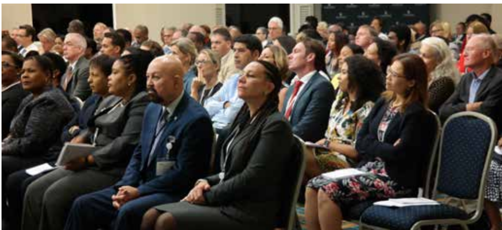
Participants at the 5th Biennial CAJO Conference