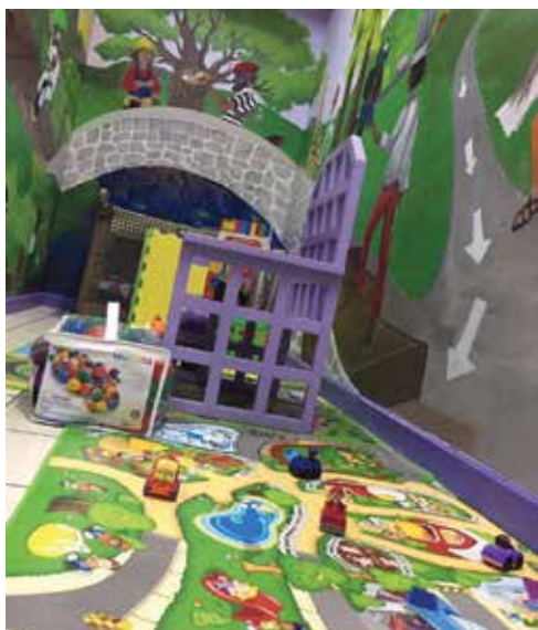
The child friendly room at the SARC