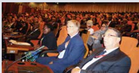
A cross section of the participants at the CMJA Conference