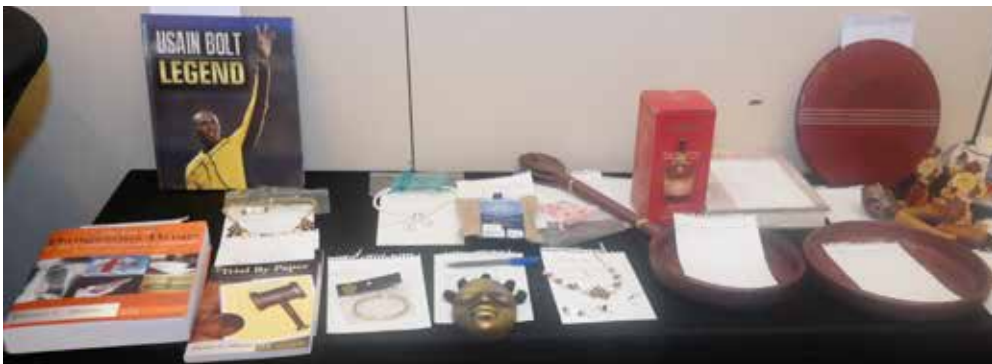
The items from the Caribbean Association of Women Judges' (CAWJ) silent auction on display

The Conference resolution further stated that these judicial officers should enjoy full immunity from suit in the execution of their duties performed in good faith. Additionally, the Association called for improvements in and strengthening of court and case management systems to meet the current and future needs of the justice system and urged that appropriate resources be