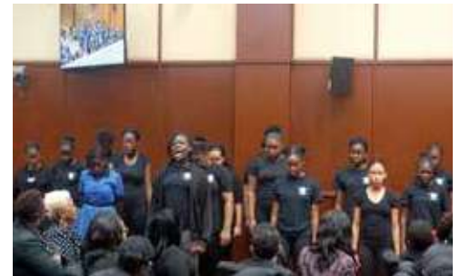
Members of the Honey Bee Theatre Group during a dramatic performance on gender bias at the opening of the SOMC

Ms. Bergeron said that the Government of Canada was heartened to know that the SOMC will remedy these ills through a number of mechanisms which include speedy adjudication of cases and reduction of case backlogs over time; improved responses to survivors that will enable their full participation in the justice system, increase offender accountability and reduce