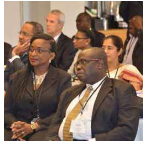
A cross section of the participants at the CJJI's Biennial Meeting

The High Commissioner urged all participants to remember the value of each human being by never forgetting that the community has interests that must be protected by reasonable restraints on the activities of individuals.