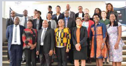
South African and Caribbean justice sector stakeholders who participated in the South-South Exchange Programme

The JURIST Project got the opportunity to share, with the South African Judicial Education Institute, its work in supporting the creation of gender-responsive judiciaries in the English-speaking Caribbean. The South African stakeholders were impressed with the Gender Equality Protocols for Judicial Officers, the accompanying gender sensitive adjudication training and the gender equality accountability tool used to track the judiciary’s performance in promoting gender equality.